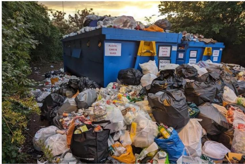
Bin strikes causing 'public health crisis' in South Gloucestershire. The scene is a residential area near Warmley on Sunday, July 9

Local authorities with lower economic inactivity rates or higher employment rates average higher healthy life expectancy